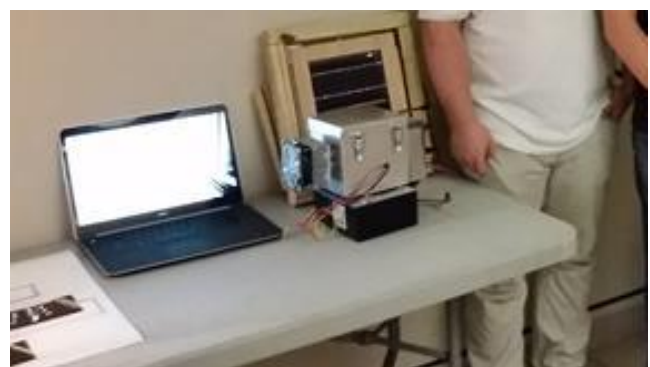
FIGURE 4 HUMAN-SOLAR-POWERED, BIKE MOUNTED, VACCINE DELIVERY SYSTEM