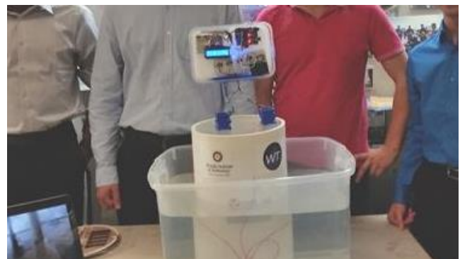
FIGURE 3 WAVE ENERGY GENERATOR – BIDIRECTIONAL WIND TURBINE

Because the students came up with the design problems of the entrepreneurial engineering project themselves and they